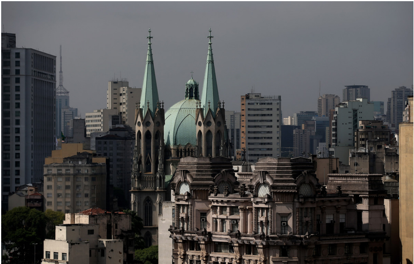
Sao Paulo is already a strong global business player, and at its current rate of development it will rapidly catch up with the top cities