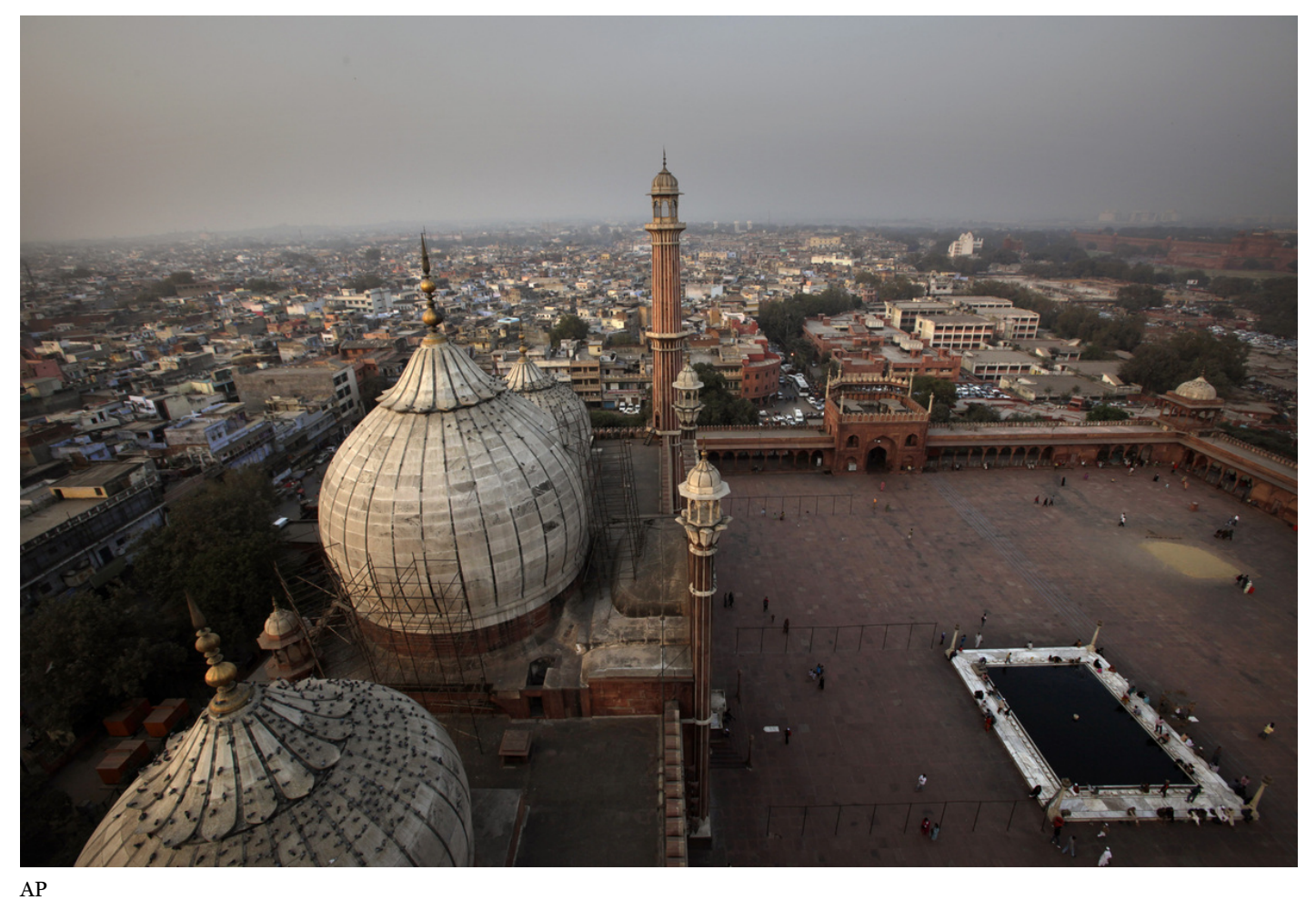
The report notes that Indian cities seem to be benefiting greatly from the country's booming global services industry. A view of the Red Fort and Jama Mosque in New Delhi, India, Dec. 8, 2011.