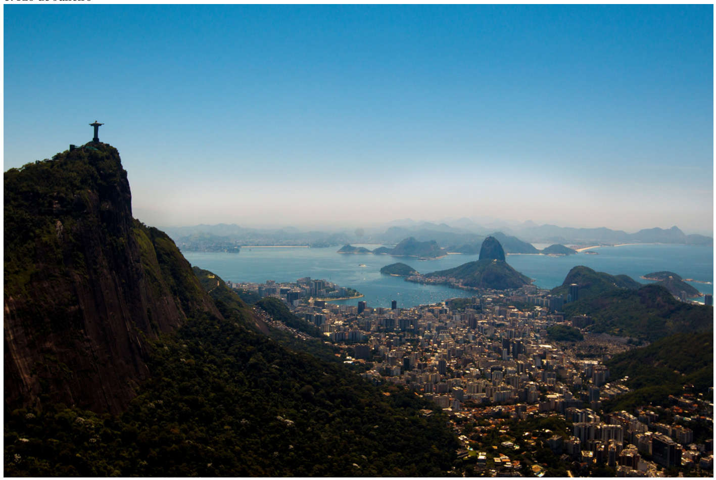
Getty Images Another Latin American city to make the top 10 emerging global cities was Brazil's Rio de Janeiro. View of Rio de Janeiro, Brazil, with Christ the Redeemer and Sugar Loaf in the background, Nov. 12, 2013. (Buda Mendes/Getty Images)